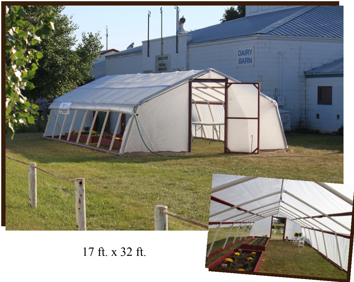
17 ft. x 32 ft.

New Mexico State University Cooperative Extension Service